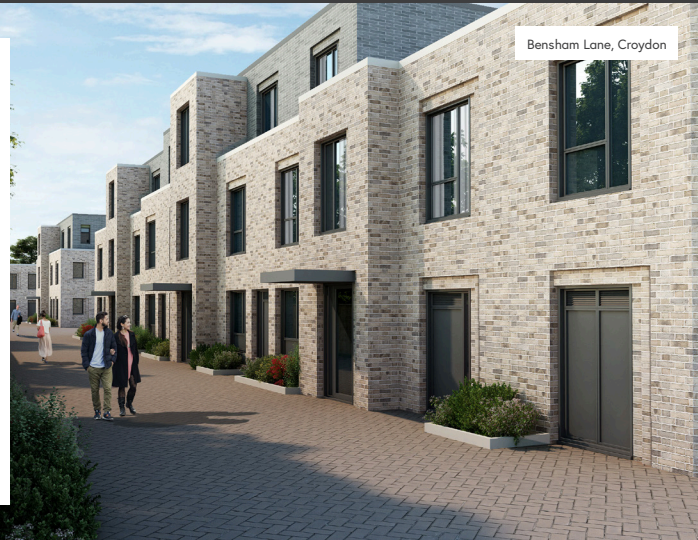
Bensham Lane, Croydon

We ended the year on a high with the completion of The Pleasure Boat Public House in Alperton, Wembley. The site consists of a 23-storey tower, with 474 new homes delivered by Peabody and Redrow Homes, along with the pub and outside public space next to the Grand Union Canal.