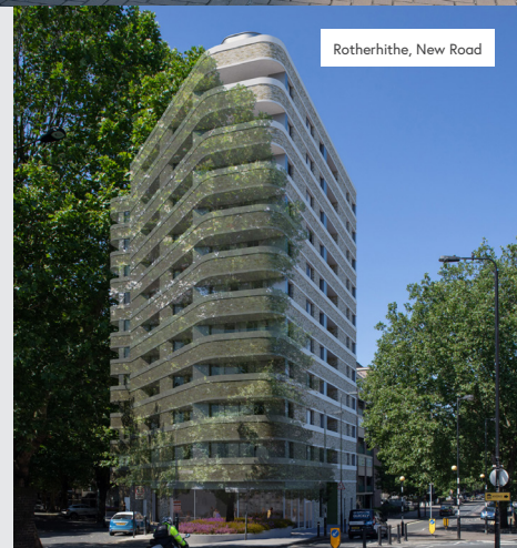
Rotherhithe, New Road

In the latter part of the year we also submitted an application for 48 new flats and commercial space at our site in Rotherhithe, working closely with Formation Architects to ensure the design retained all the public space and existing trees. We look forward to receiving news on planning in 2020.